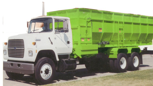
J&A 1000 TRUCK

700 AND 1000 FOOT CAPACITIES TRUCK AND TRAILER MOUNTS