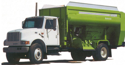
J&A 6000R TRUCK

300, 500 AND 600 FOOT CAPACITIES TRUCK, TRAILER AND STATIONARY MOUNTS