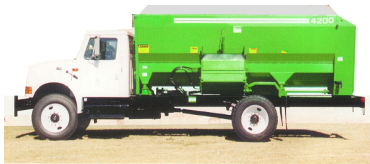
J&A 4200 TRUCK

320, 370, AND 420 FOOT CAPACITIES TRUCK, TRAILER AND STATIONARY