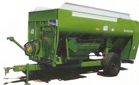
J&A 3000R TRAILER

300, 500 AND 600 FOOT CAPACITIES TRUCK, TRAILER AND STATIONARY MOUNTS