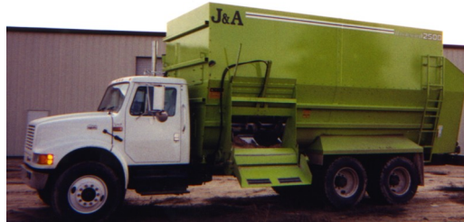
J&A 12500 WITH 52" ROLLER